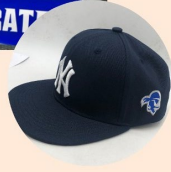
Seton Hall Yankees hat!